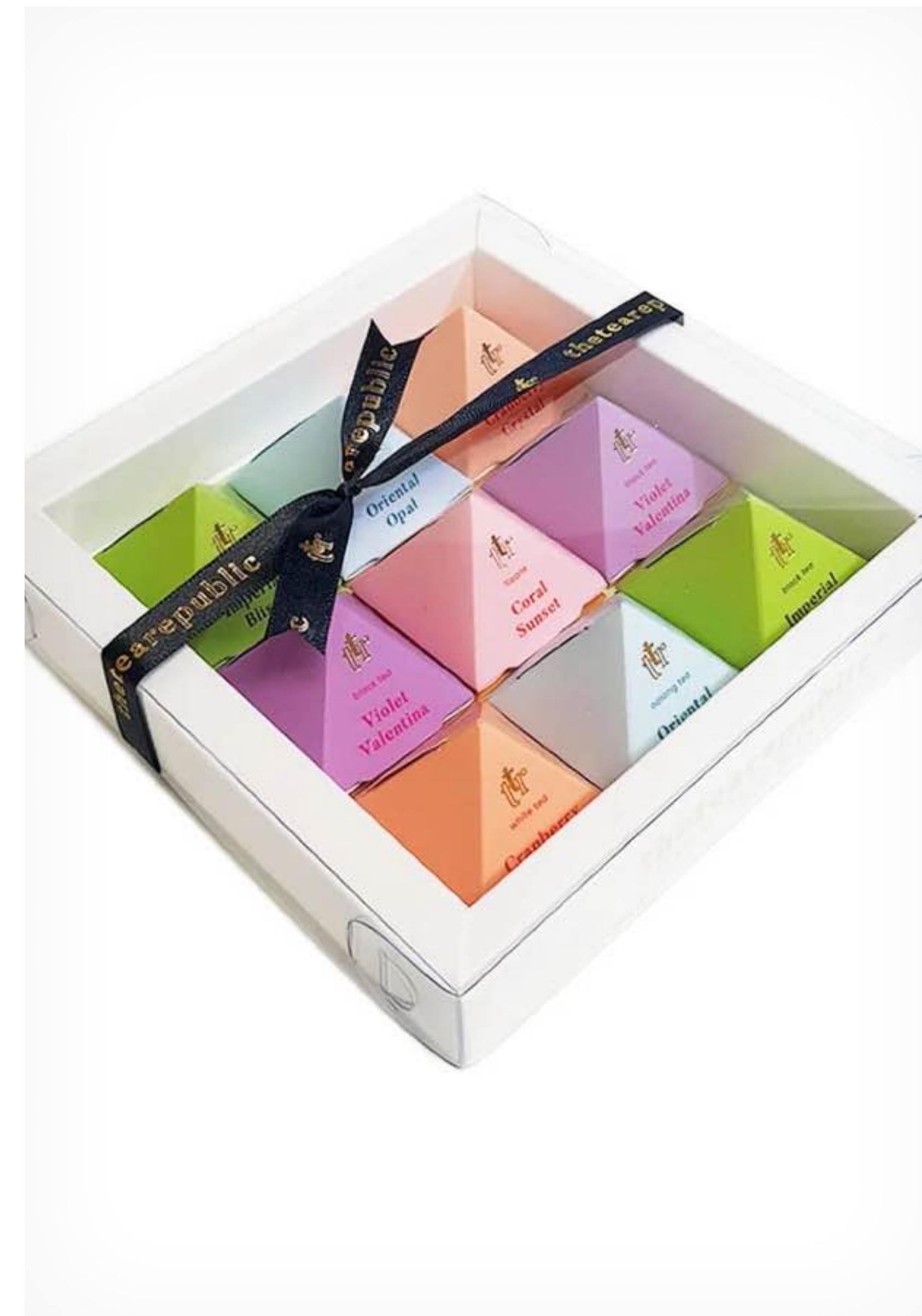
Tea Pyramid Gift Box