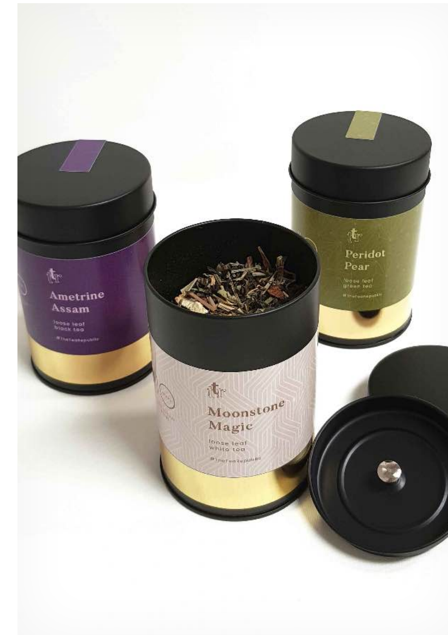
Tea Canisters, 75g