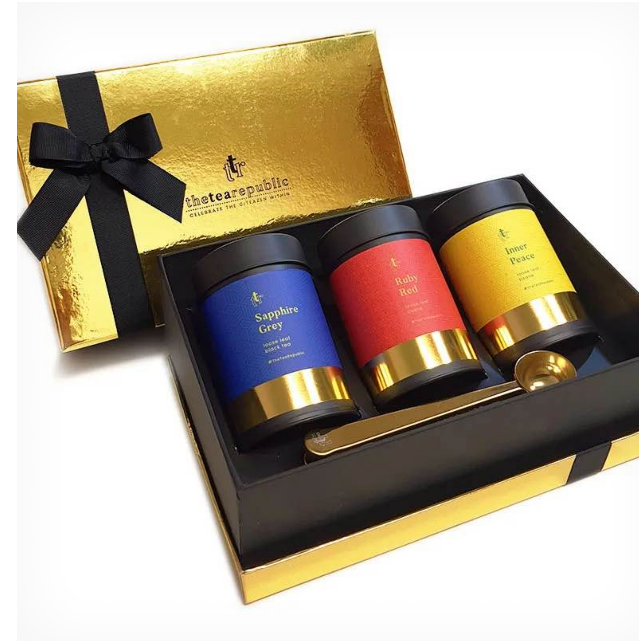
Sample from the special gift collection

Tea canisters are ideal products for avid tea drinkers. Get up to 75g of loose leaf tea in a reusable canister. Each canister yields approximately 25 to 30 cups of tea. You can choose from our signature tea blends.