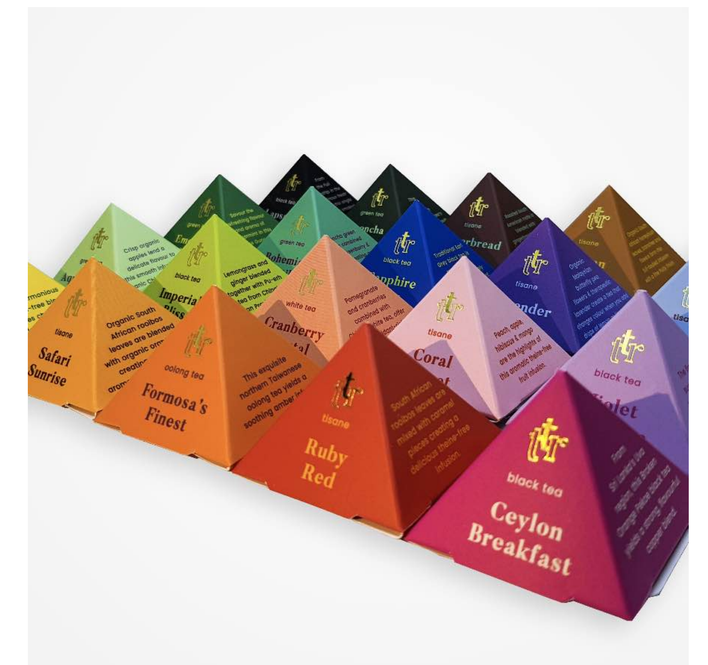
A sample of The Tea Republic's individual tea pyramids