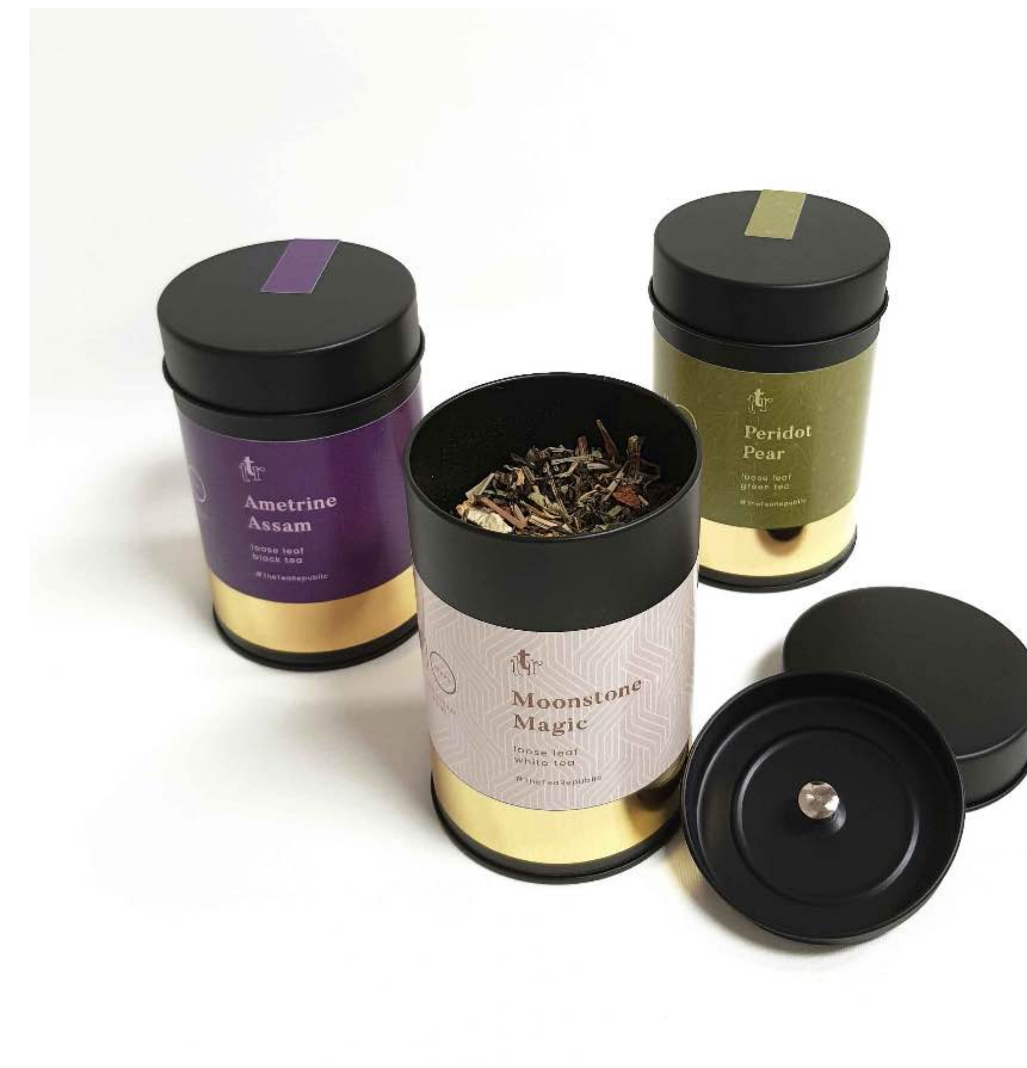
Sample of The Tea Republic tea jars