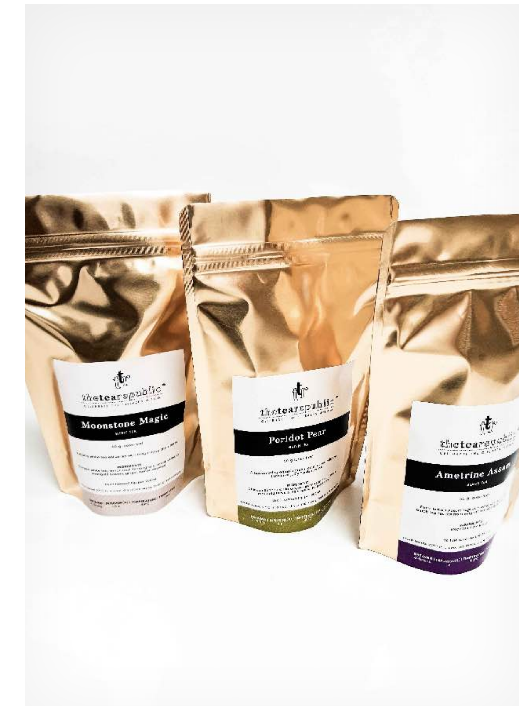
Tea Pouches, 50g