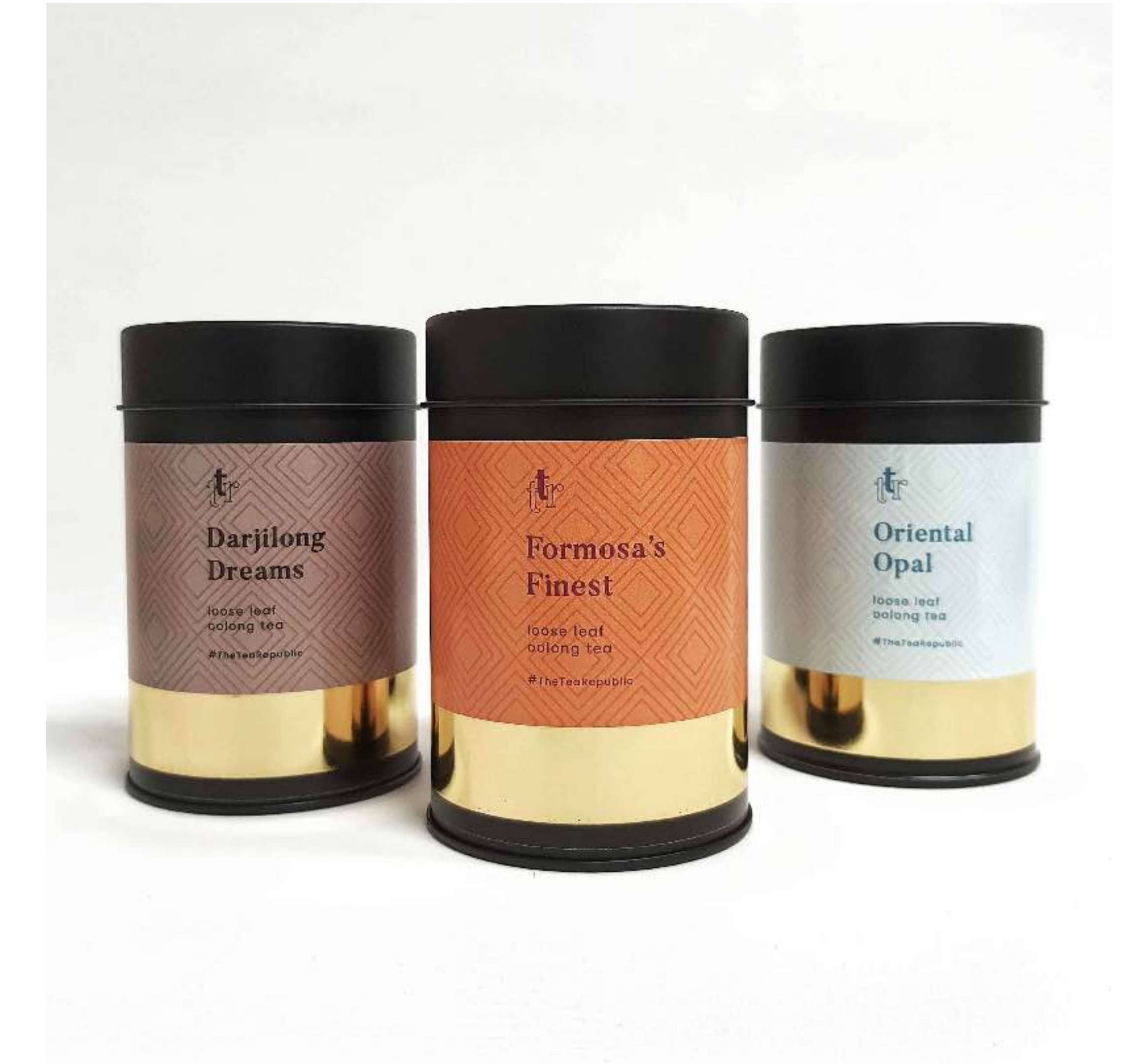
Sample of The Tea Republic tea jars