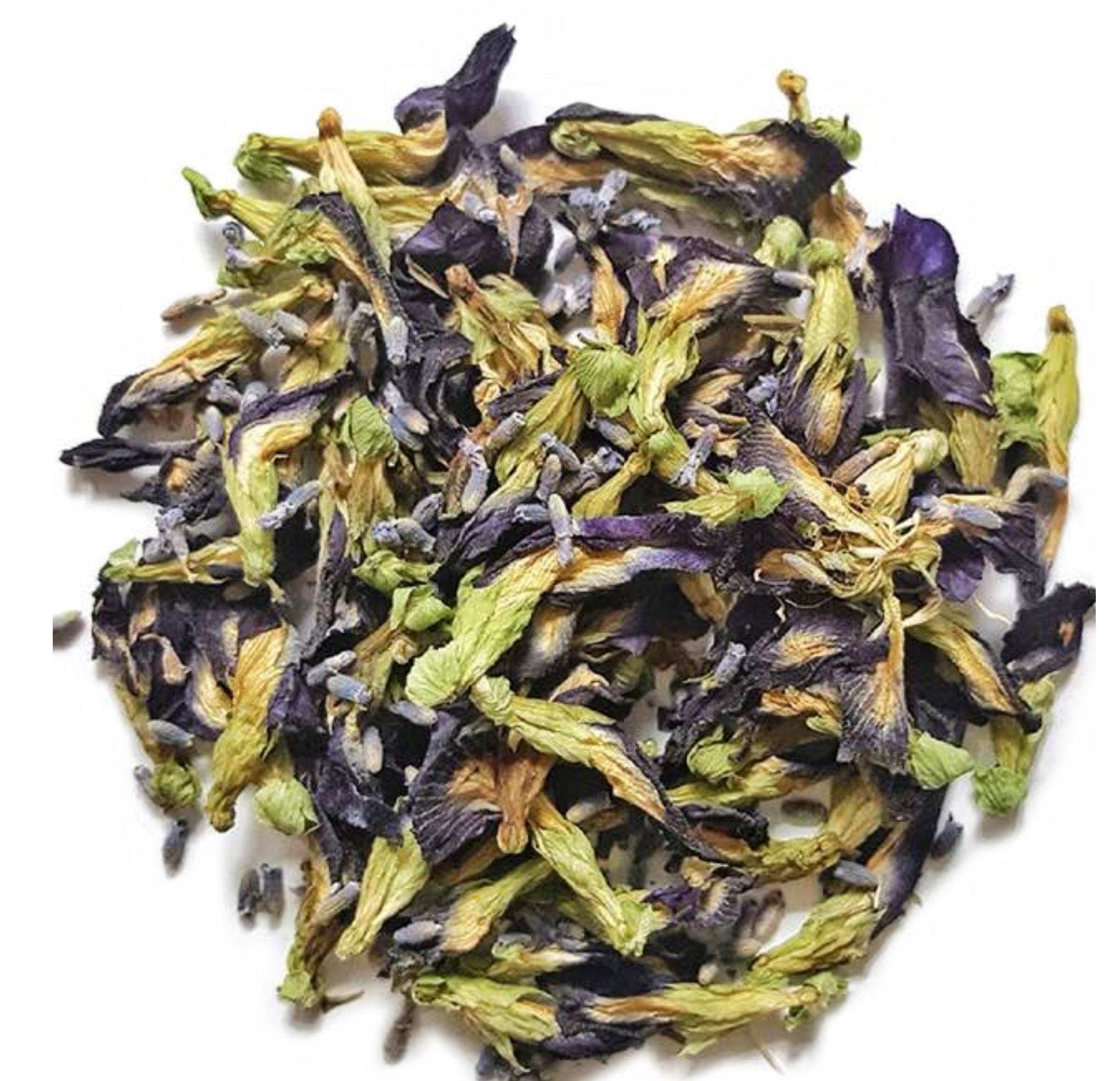
Herbal tea (Tisane)