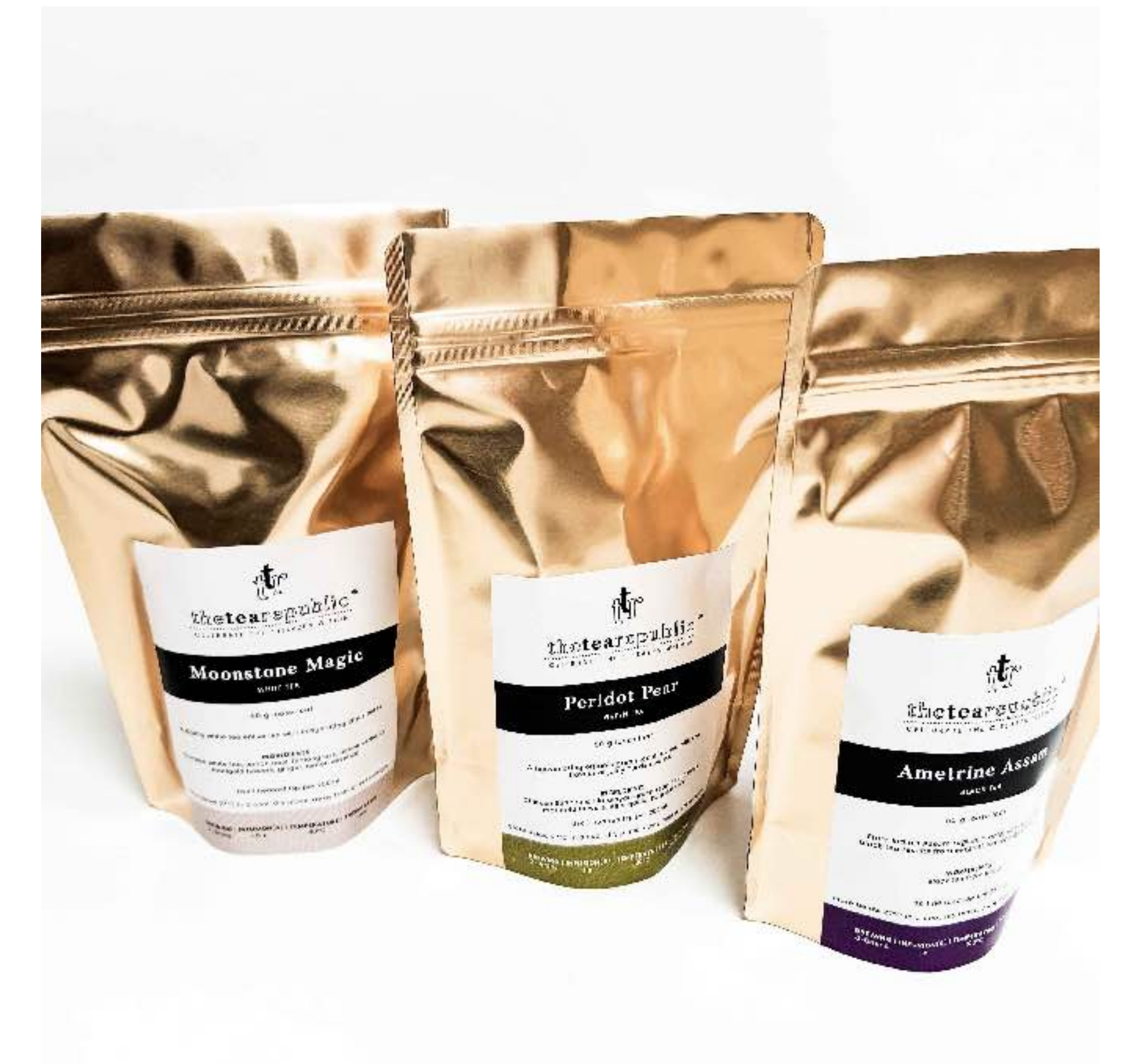
Sample of The Tea Republic tea pouches