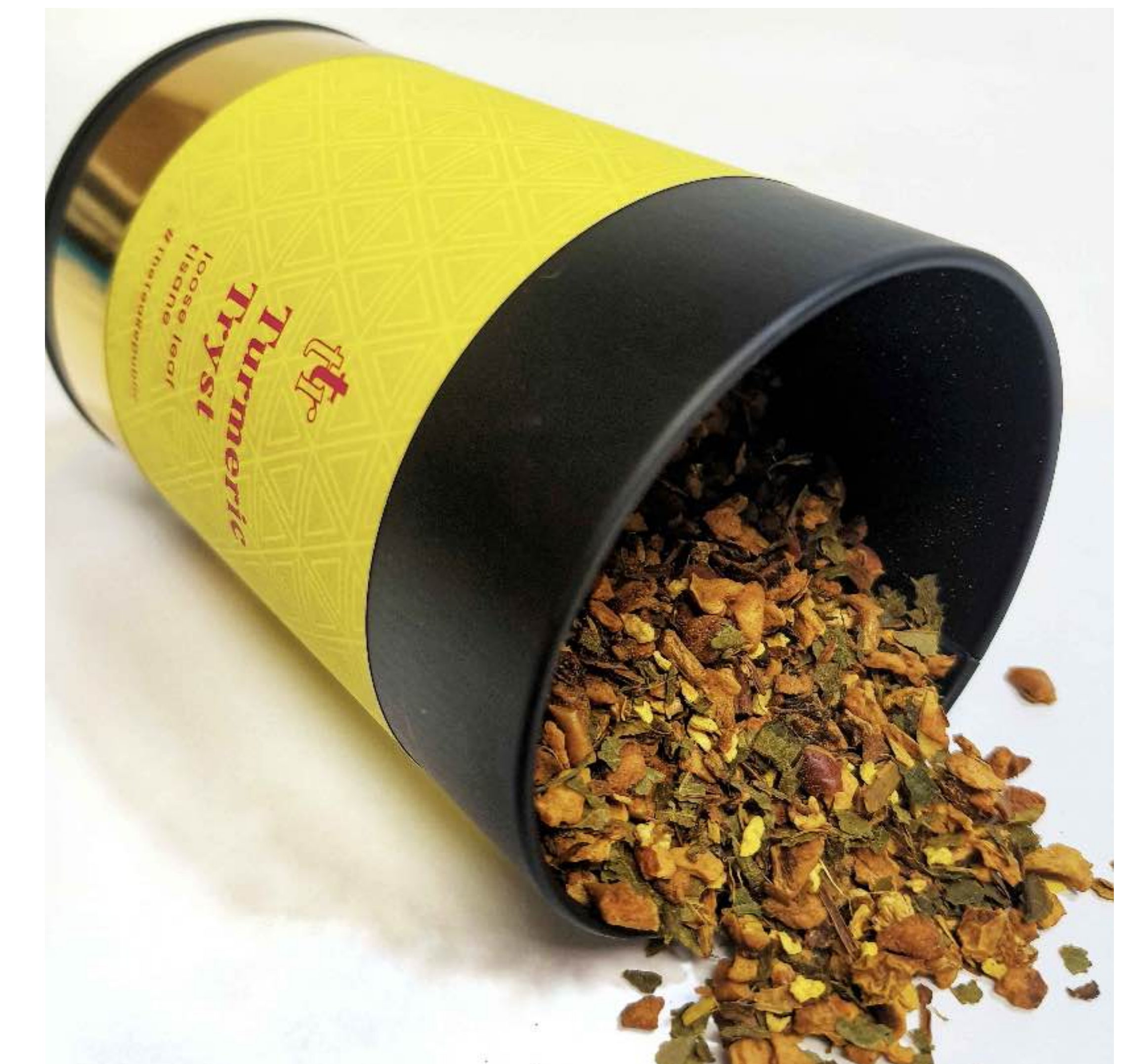
Each jar contains 50g of loose leaf tea