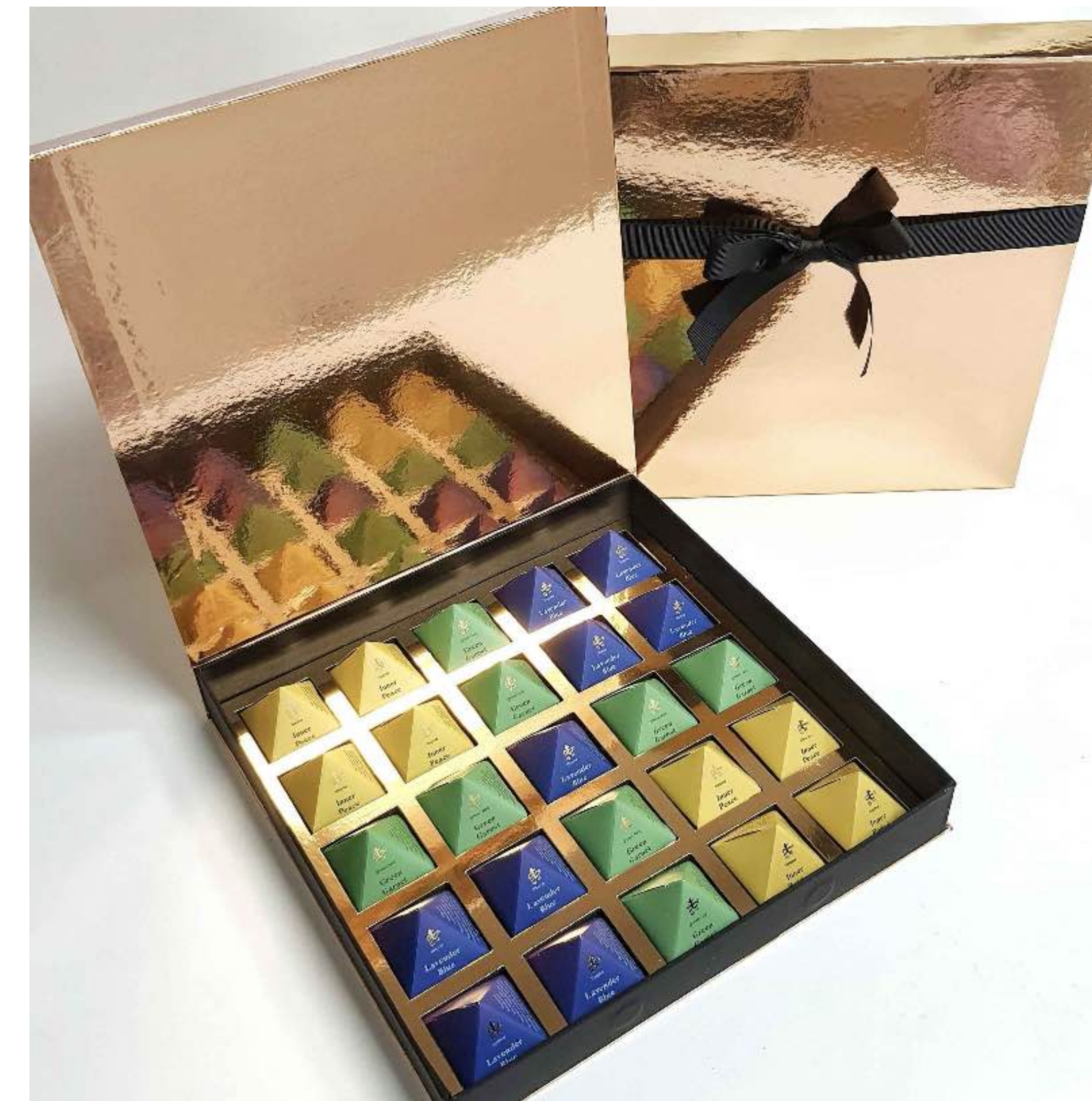
Sample from the special gift collection

Tea pyramids are our trademark product and allow customers to choose from our signature tea blends. Each tea pyramid contains a biodegradable tea infuser filled with loose leaf tea—suitable for a 300ml brew.