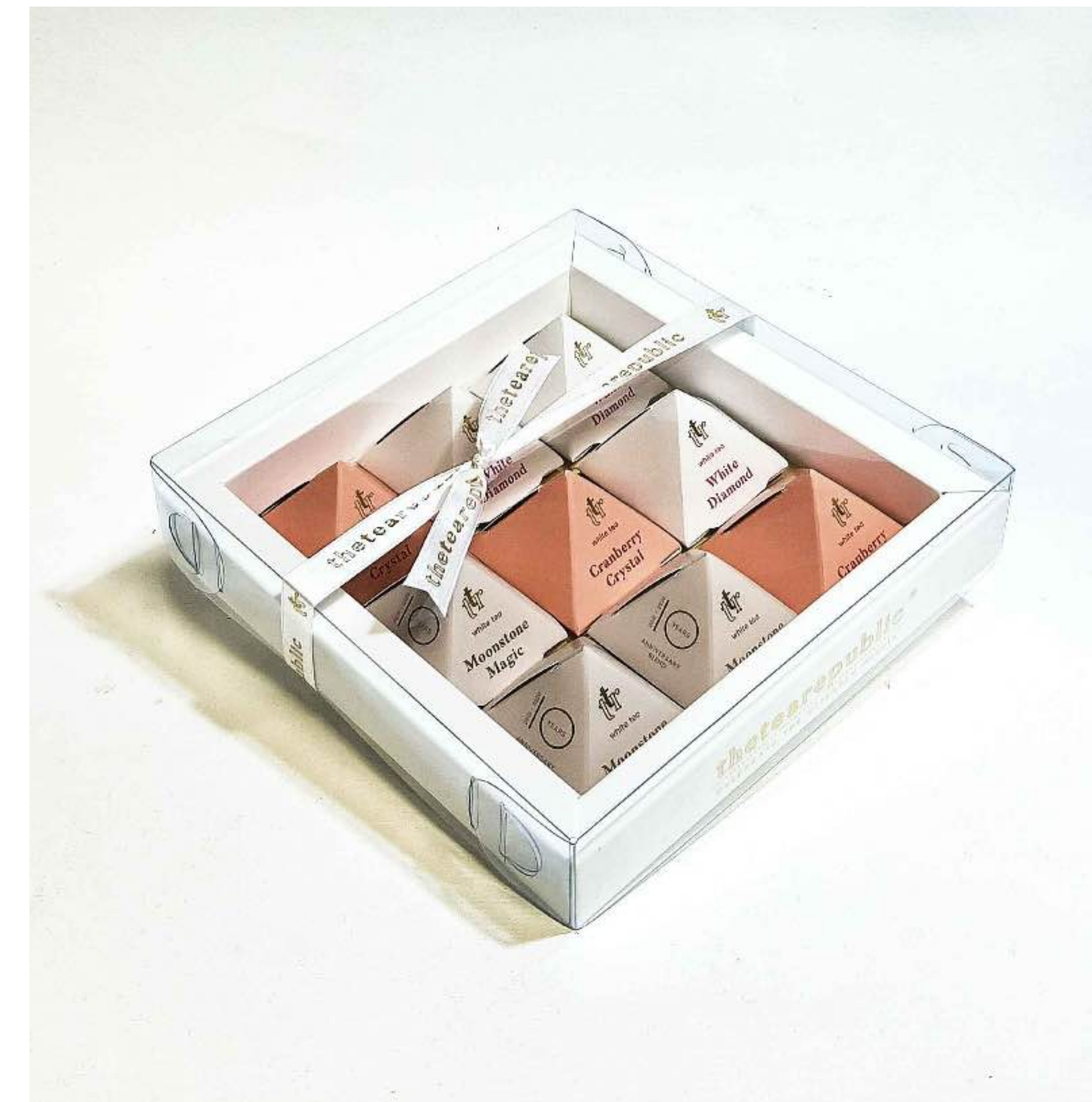
Sample of "The Whites" gift pack

Our best-selling product contains nine tea pyramids offering customers a chance to purchase a collection of diverse, carefully selected tea blends in unique packaging. Each pyramid contains a biodegradable tea infuser filled with loose leaf tea—suitable for a 300ml brew.