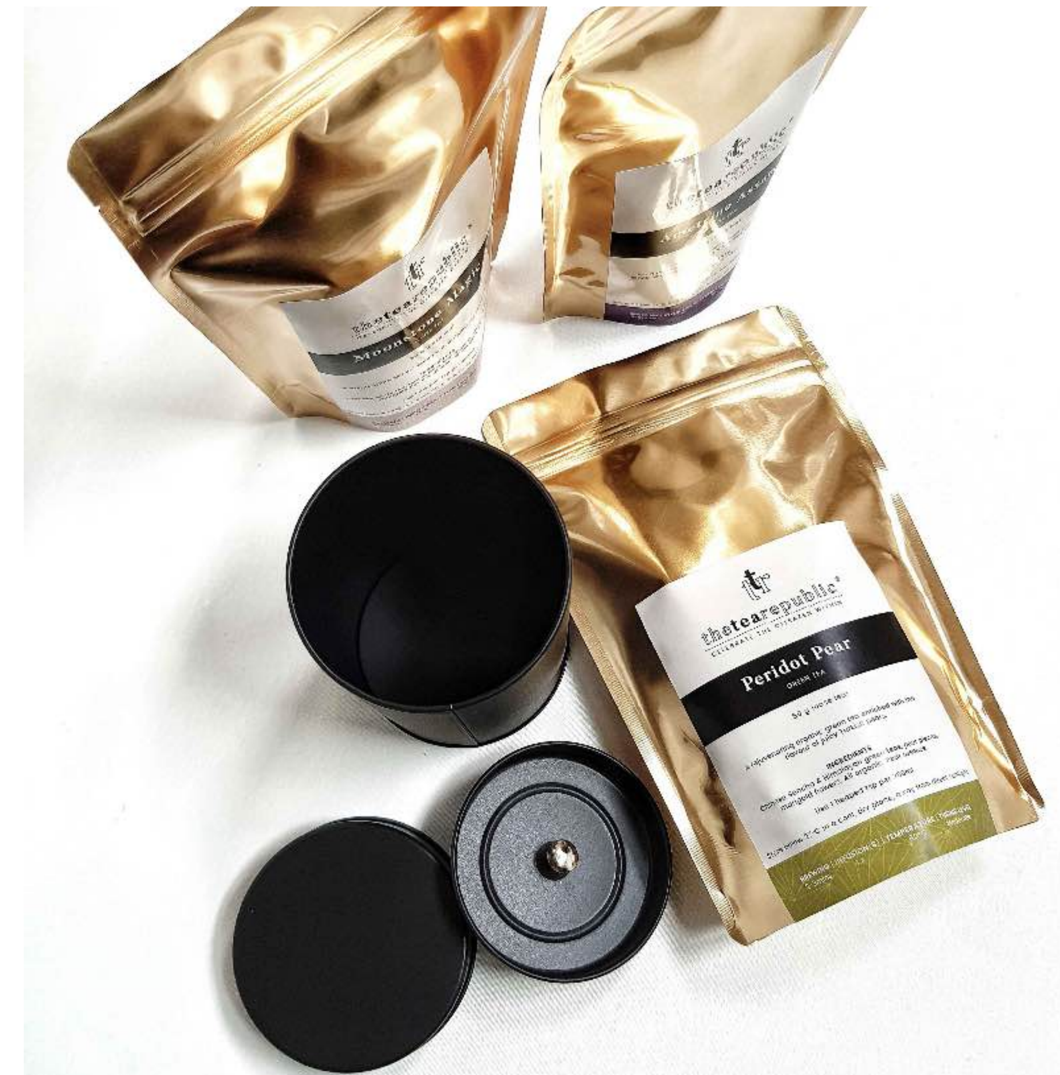
Sample of The Tea Republic tea pouches and jars

Tea pouches are our most economical product, suitable for tea drinkers who know what they want—or want to try something new. Each pouch contains up to 50g of loose leaf tea. Each pouch yields approximately 20 to 25 cups of tea. You can choose from our signature tea blends.