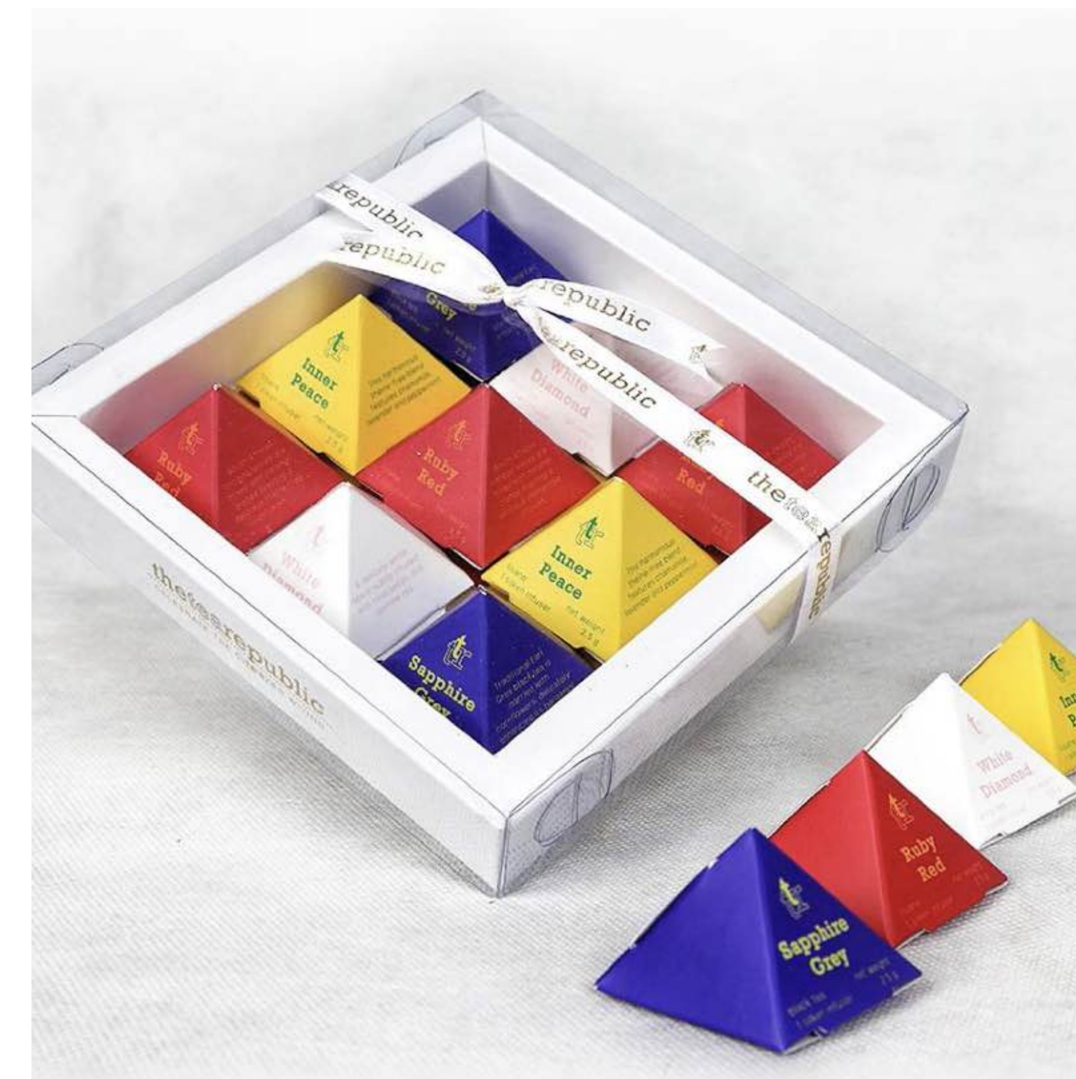
Sample from the special gift collection