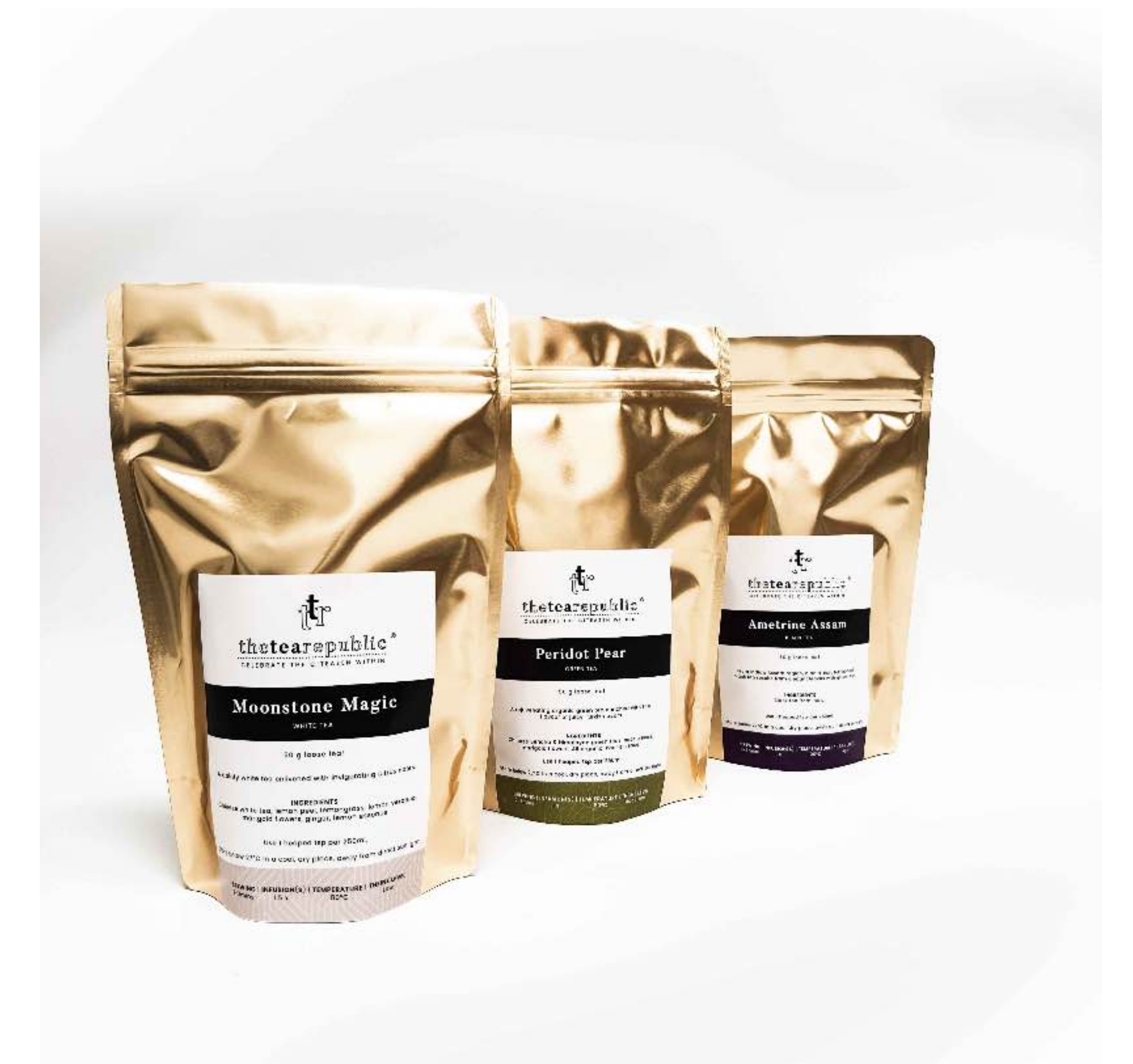
Each pouch contains 50g of loose leaf tea