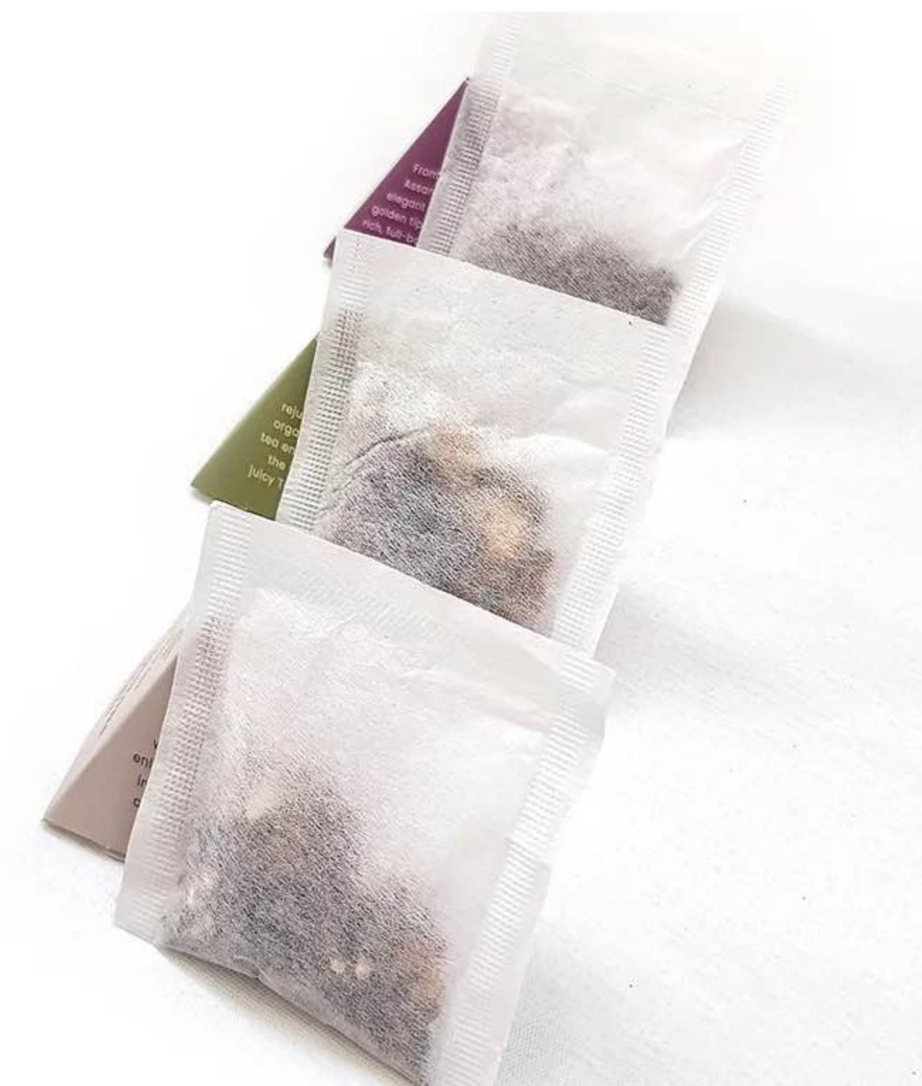
Each pyramid contains an organic infuser with loose leaf tea