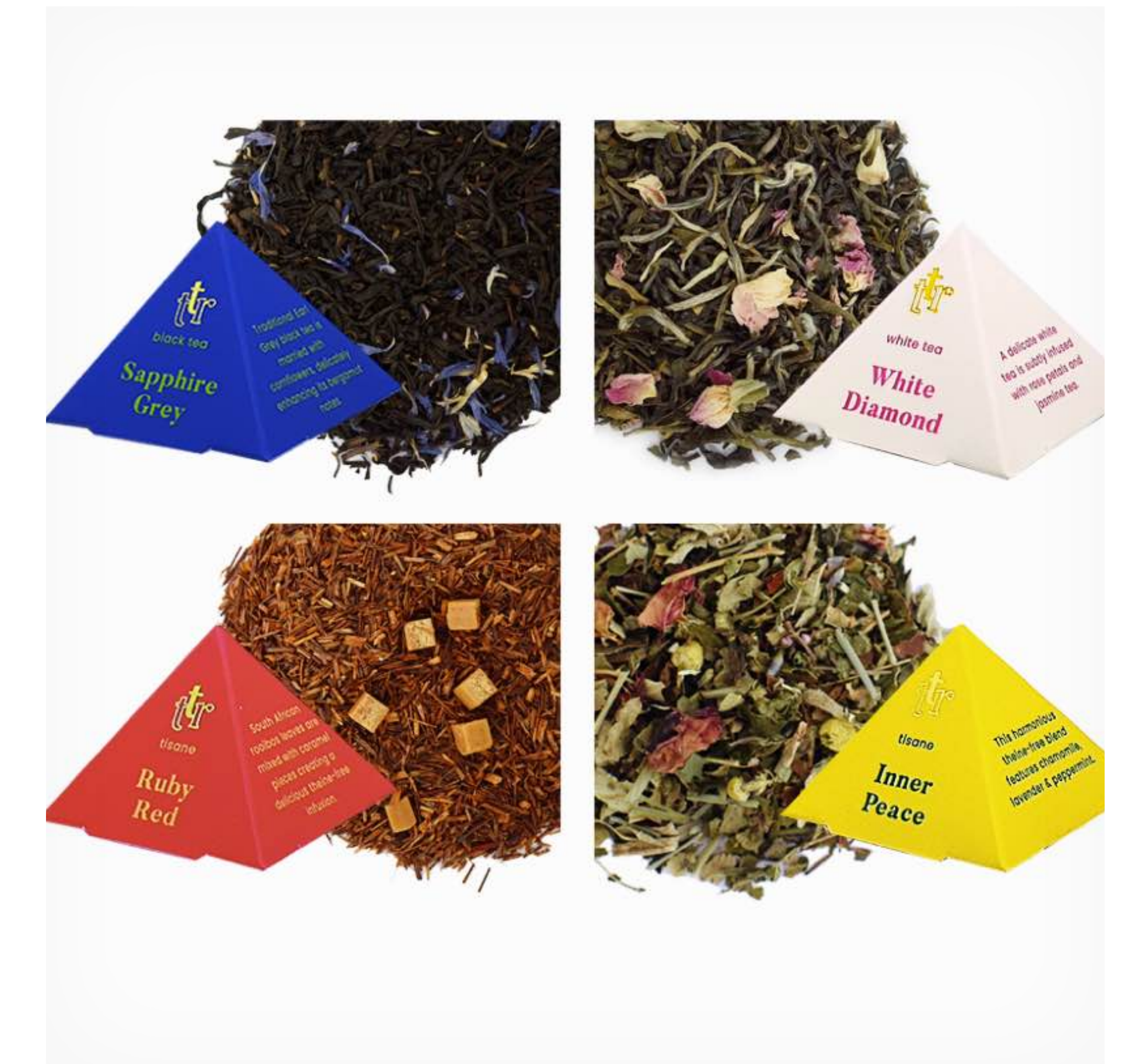
Sample teas and pyramids