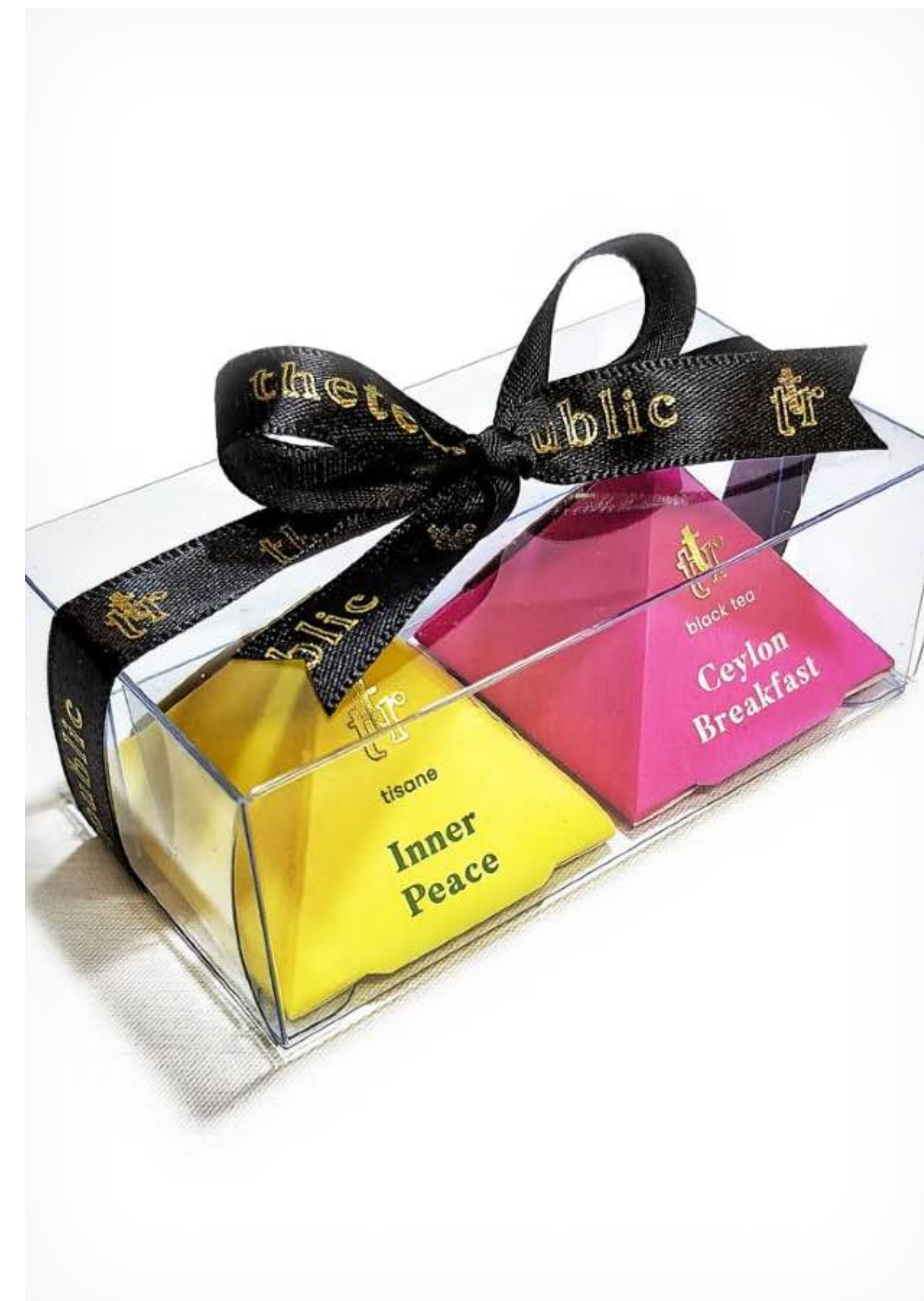
Tea for 2 Gift Box