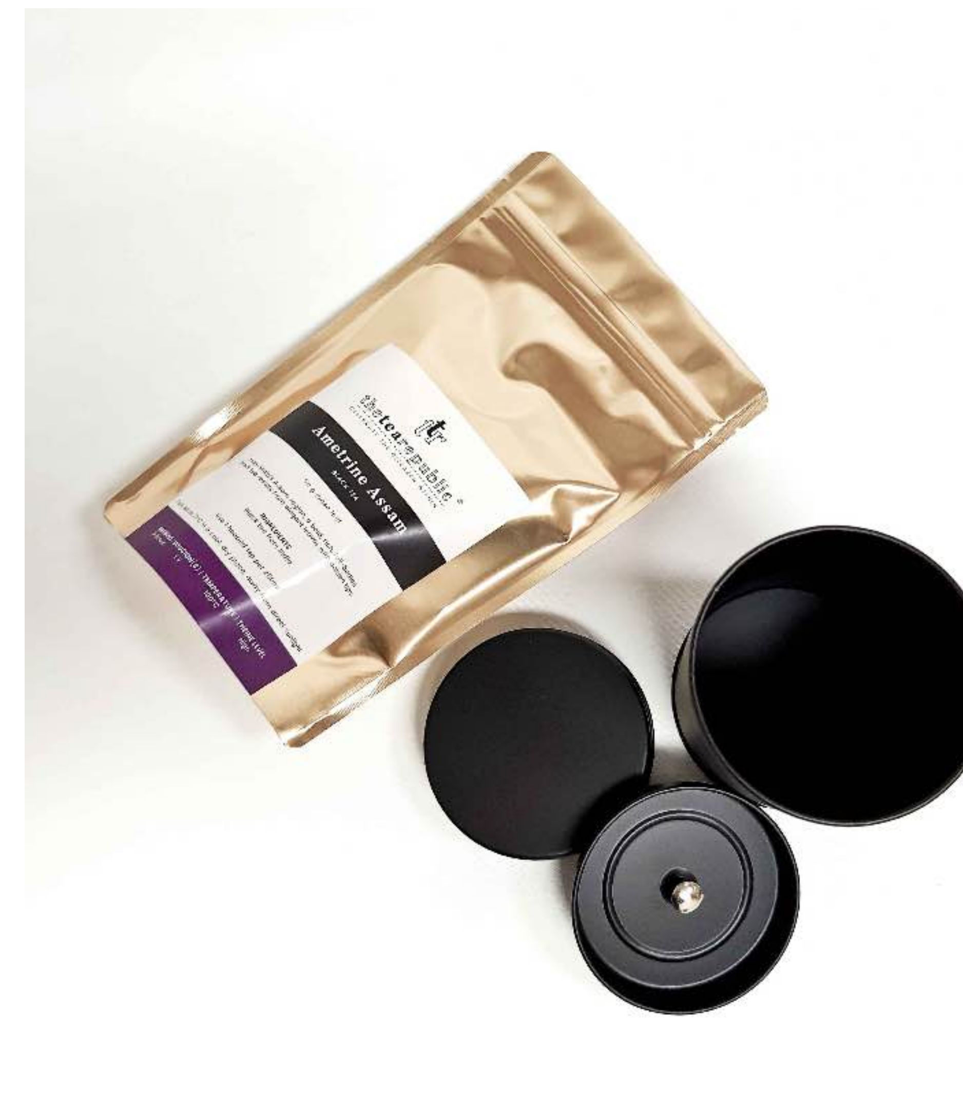
Sample of The Tea Republic tea pouches and jars