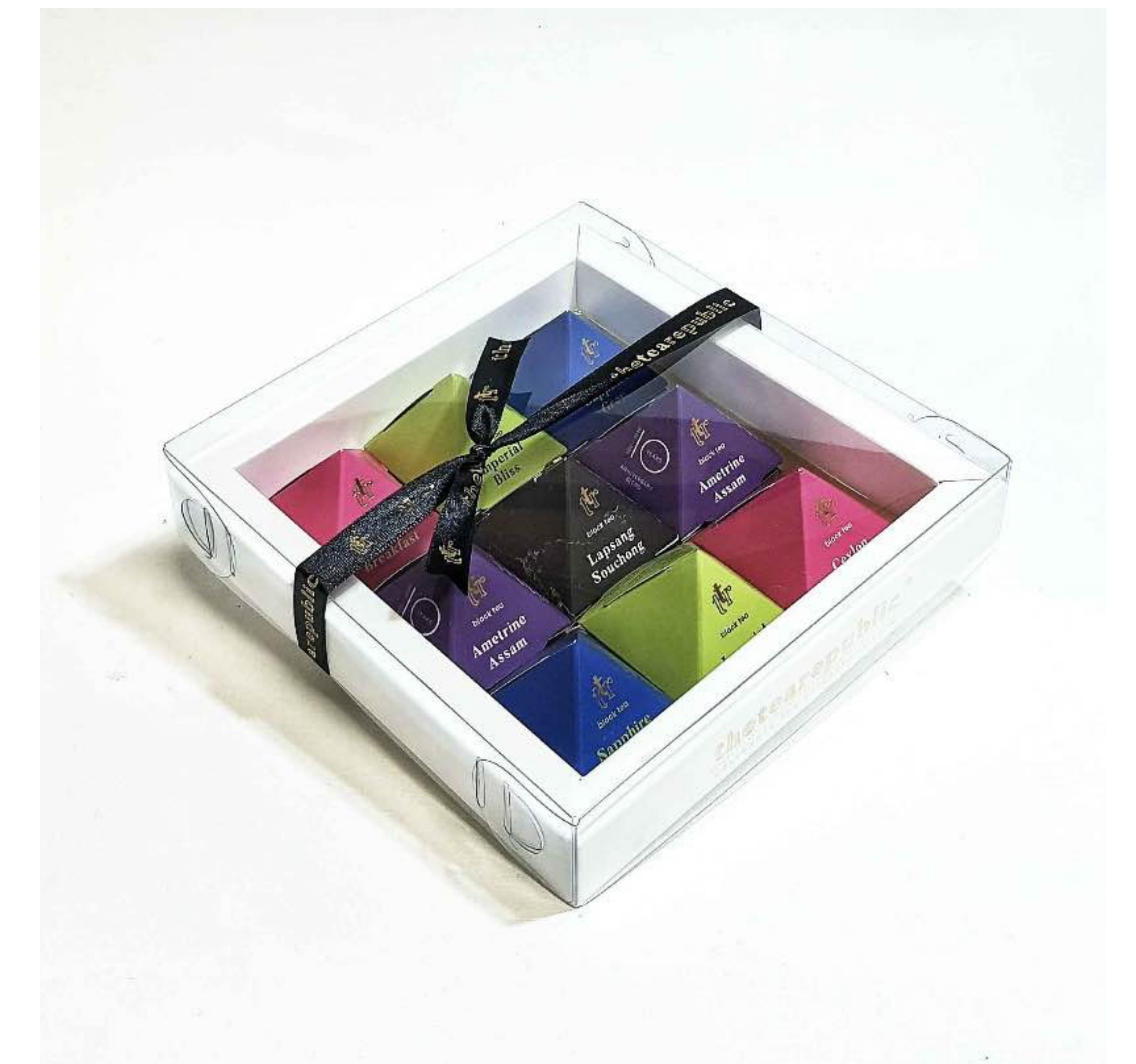
Sample of "The Blacks" gift pack