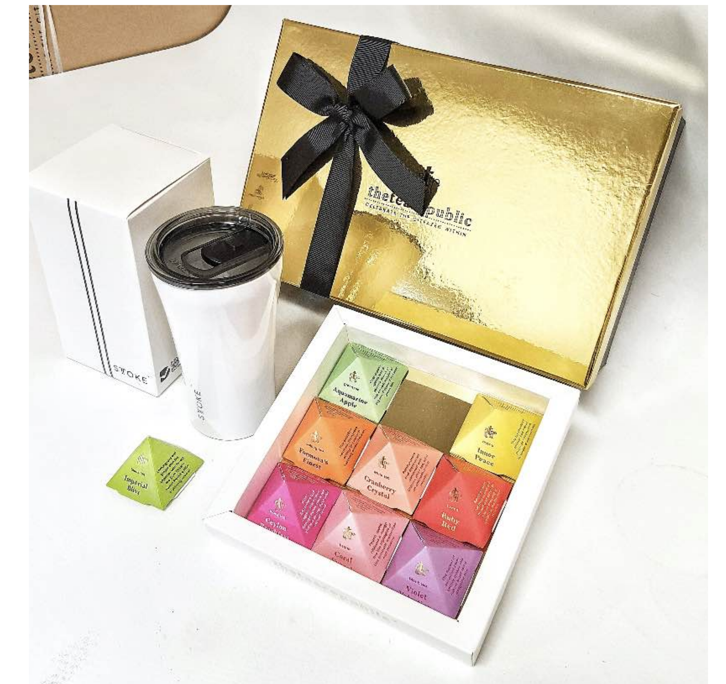
Sample from the special gift collection